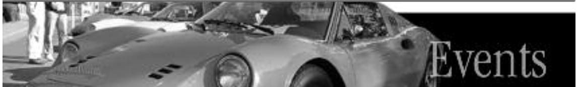
FCA Southwest Region events in bold

We look forward to your participation at our events!